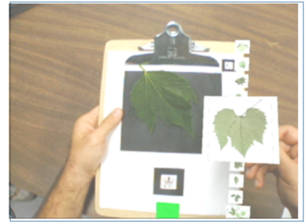
Results from automatic search are displayed. Card morphs into leaf.