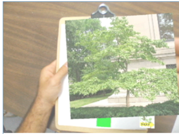
Leaf, plant, and other aspects of species are inspected and compared for identification.